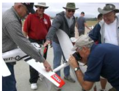
OOPS!! Mid Air? Who did it??