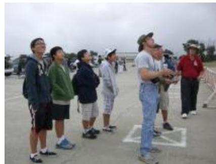
Boy Scouts looking upward!!!!