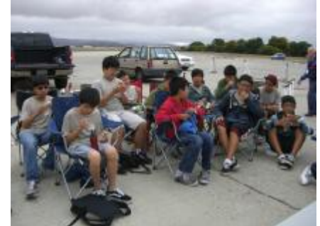
Boy Scouts taking a snack break.