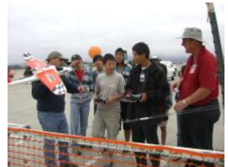
Boy Scouts have questions????