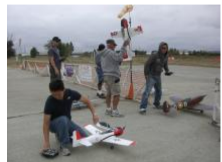
Club members ready to perform for Scouts